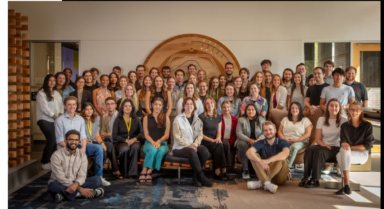
Corgan's summer intern group in Dallas, Texas.